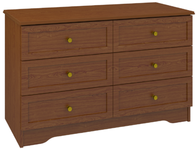
Model: LADR60 48.5W 19D 30H

The Lancaster Collection offers unobtrusive refinement and skilled craftsmanship to form the perfect balance between function and beauty. Rich OG detailing on the tops and recessed insert panels set into chamfered frames on doors and drawers. Collection available with or without contrasting edges as well as custom color combinations.